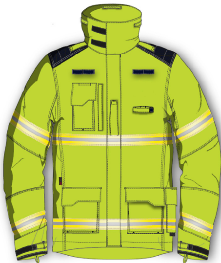
902 Wildland Jacket