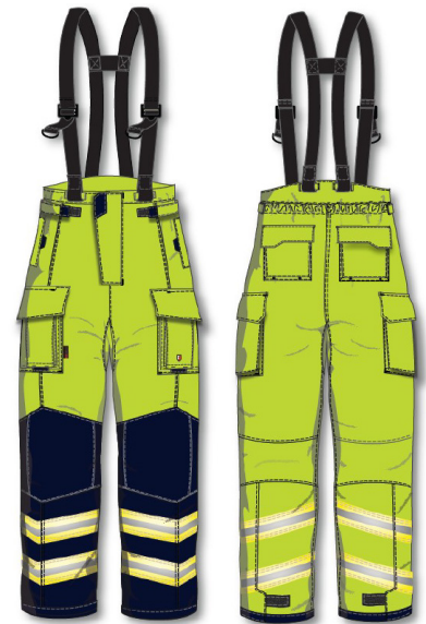
903 Wildland Trouser

www.frsa.com.au | admin@frsa.com.au | + 61 7 3209 7422